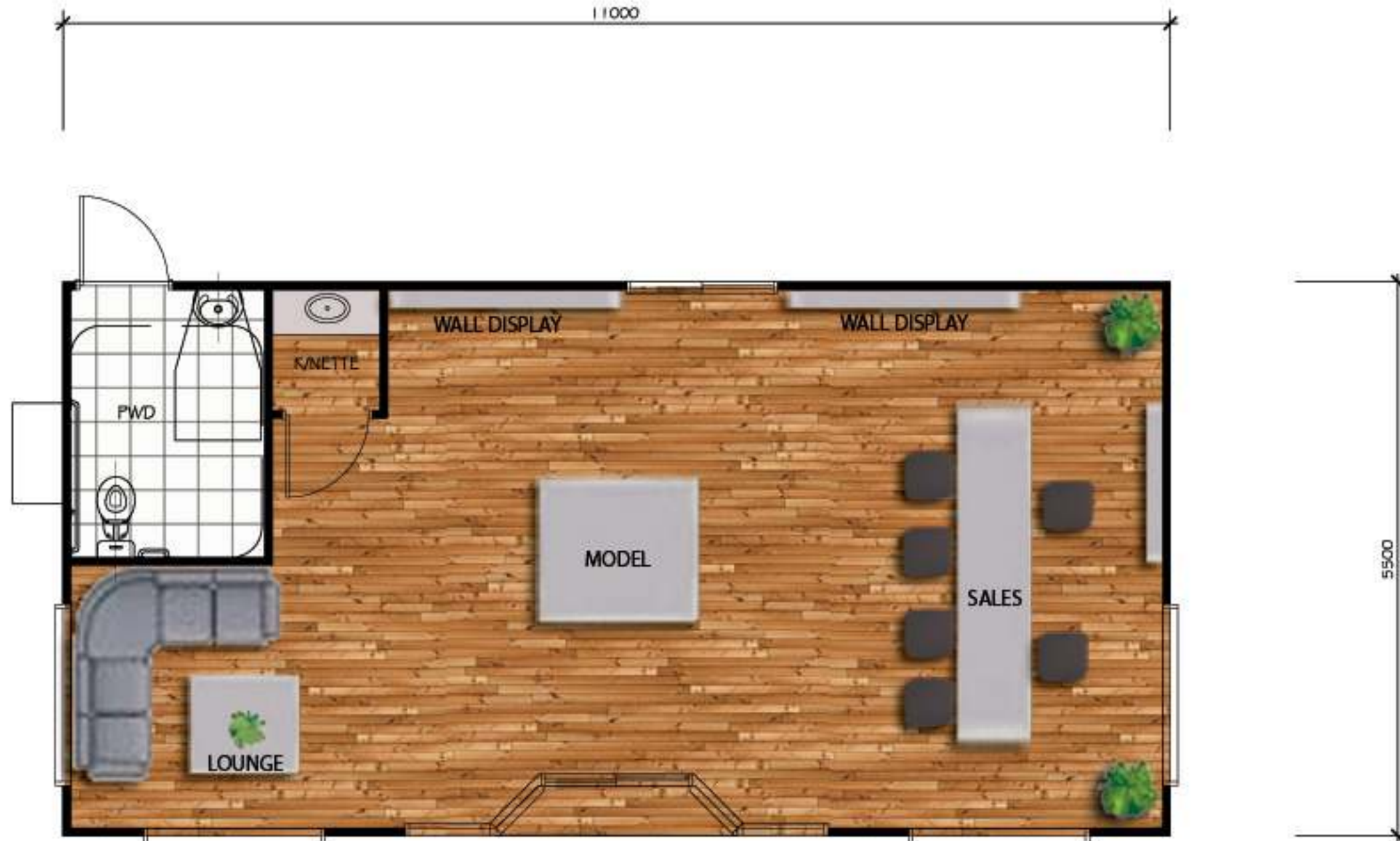
SALES OFFICE (OPEN PLAN)

COPYRIGHT: THIS DRAWING REMAINS THE PROPERTY OF SPM GROUP AND IS PROVIDED FOR THE USE AS DESCRIBED AND MAY NOT BE USED OR REPRODUCED IN WHOLE OR IN PART WITHOUT WRITTEN PERMISSION.